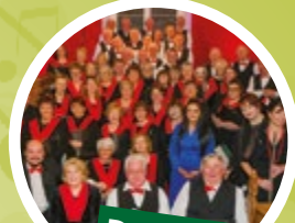
Roscommon Solstice Choir