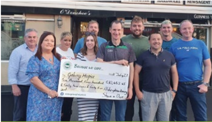
Abbeyknockmoy Shave or Dye raised a grand total of €10,442.45 for Galway Hospice.