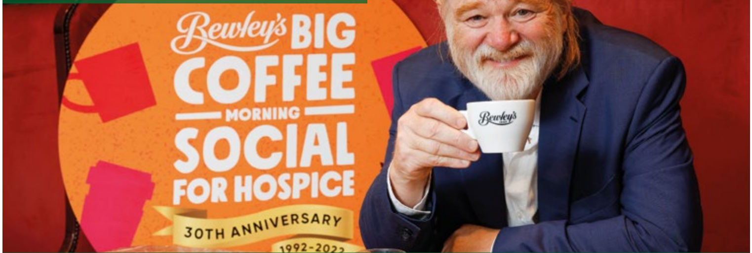
Actor Brendan Gleeson was delighted to launch this year's Bewley's Big Coffee Morning Social for Hospice recently.

Bewley's Big Coffee Morning Social for Hospice is one of Ireland's longest established and most loved fundraisers in aid of specialist palliative hospice and community palliative care services all across Ireland. 2022 marks the 30 th anniversary of the campaign and we are thrilled to welcome our supporters back to our own Coffee Morning at Galway Hospice this September. We very much look forward to chats with hosts, live demonstrations and most importantly, a cuppa while sharing stories!