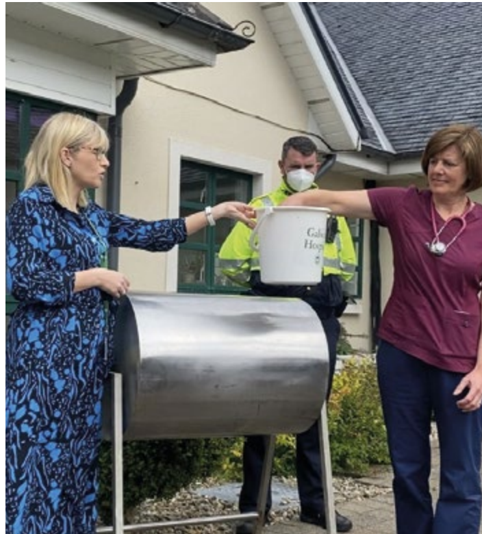
The Winners of this year's Galway Hospice Car Raffle were drawn by staff members with a local member of An Garda Síochana, who witnessed the draw.

The support for the car raffle was truly overwhelming for another year running. Galway Hospice would like to extend their gratitude to everyone in Galway and beyond who supported the raffle by purchasing tickets.