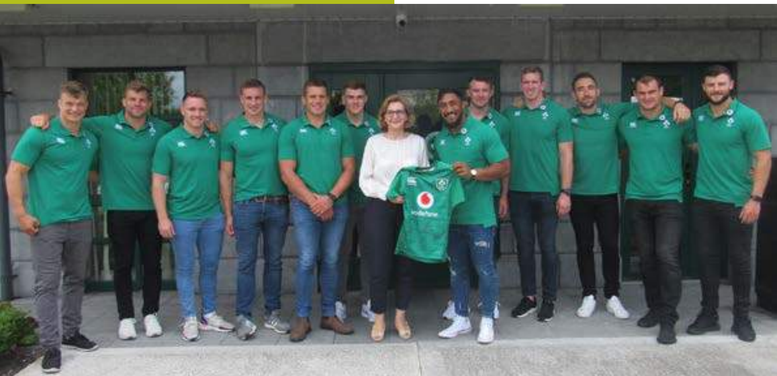
In July the Irish Rugby squad members paid a special visit to Galway Hospice to meet with patients and present a signed Ireland Jersey to Galway Hospice