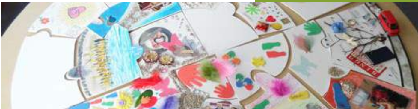
Artwork created by patients showing the mix of elements that make up the Day Care service