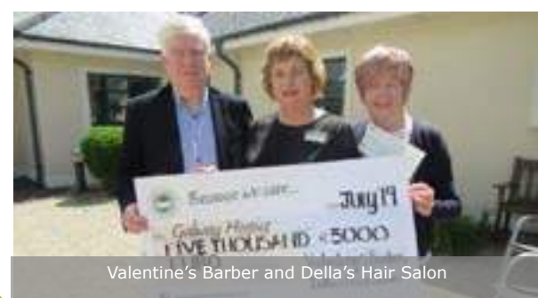
Valentine's Barber and Della's Hair Salon