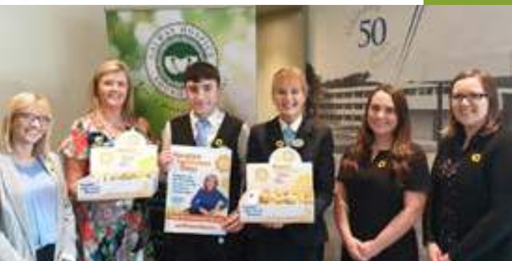
THE CONNACHT HOSPITALITY GROUP