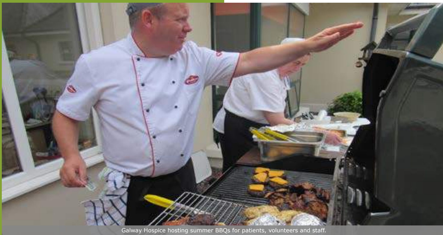
Galway Hospice hosting summer BBQs for patients, volunteers and staff.