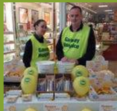
MARKS AND SPENCER