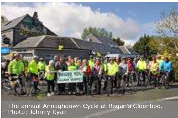
The annual Annaghdown Cycle at Regan's Cloonboo.